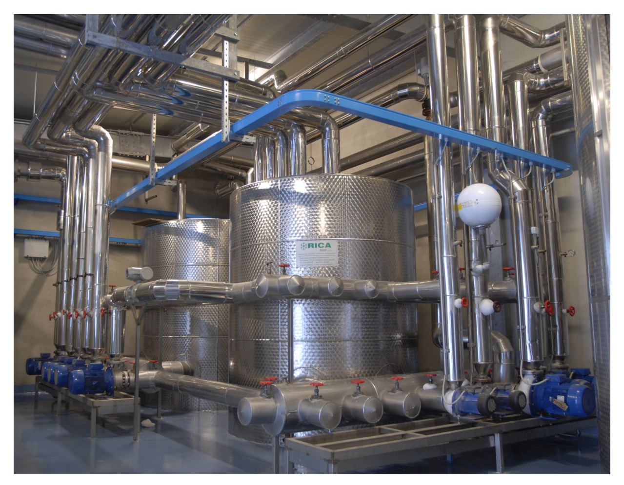
HYDROGLYCOLIC SOLUTION STORAGE AND PUMPING STATION

Design and construction of hydraulic and electrical systems for the food industry, performed by specialized personnel.